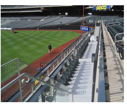
Premium seating blends within the existing ballpark.

We elevate places where experiences happen by providing innovative engineering, fabrication, and installation solutions to the most complex challenges. Discover our unconventional approach.