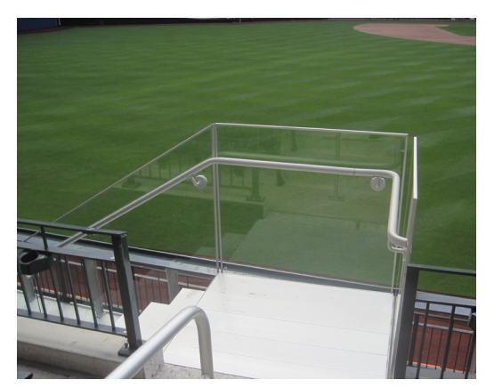
Track rail glass railing assures a clear view of the field.