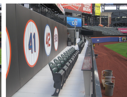
Ribbed aluminum flooring provides a rigid and safe walking surface.