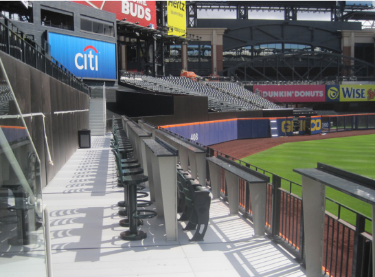
Decorative and functional drink rail provide amenity for fans.