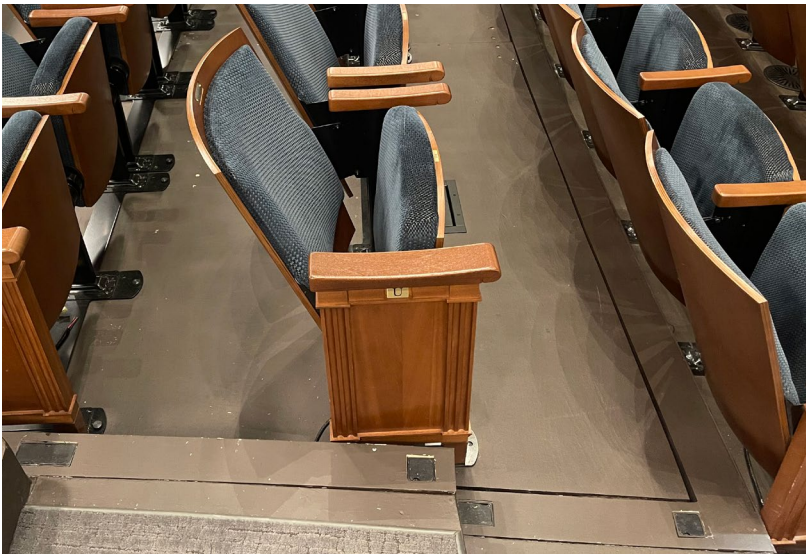
Uplift® platforms provide modular seating solutions and allow for an adaptable space to meet changing needs.