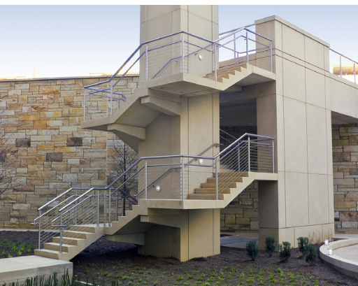
All exterior Casino™ railing is fabricated with grade-316 stainless steel.