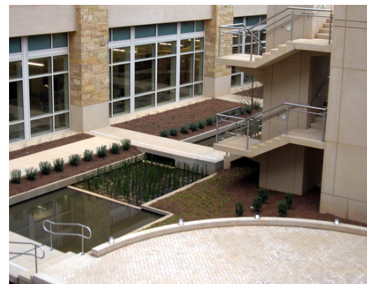
Free-standing stainless steel handrails protect and guide pedestrians.

We elevate places where experiences happen by providing innovative engineering, fabrication, and installation solutions to the most complex challenges. Discover our unconventional approach.