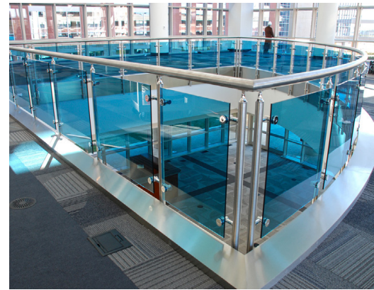
Optional colored glass panels create a truly unique railing system.