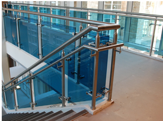
The grand stair is encapsulated by windows, drenched in natural light.