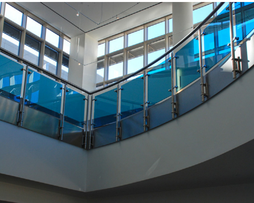
Southpark stainless and glass railing is fascia-mounted with custom, extended height brackets.