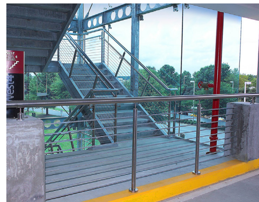
In areas where traffic/pedestrian separation is required, the stainless cables terminate directly into the concrete barriers.

We elevate places where experiences happen by providing innovative engineering, fabrication, and installation solutions to the most complex challenges . Discover our unconventional approach.