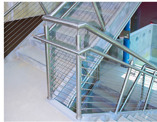
Each stair application features a 1.5" postmounted, continuous welded handrail.