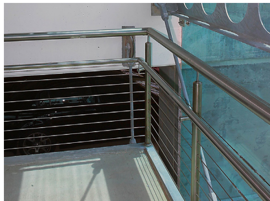
Corners are single-posted with cables terminating on either side of the post.