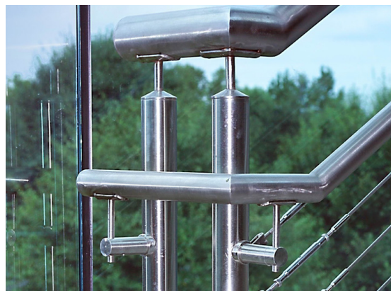
Double posts at termination on landings allow for extension and return of the continuous welded top cap and handrail.