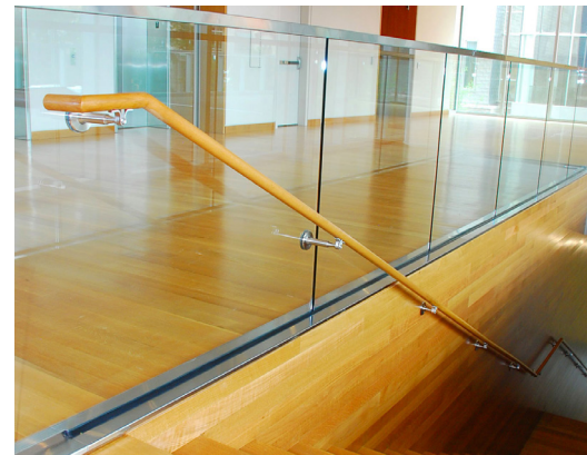
The embedded shoe mount is clean and sturdy.

We elevate places where experiences happen by providing innovative engineering, fabrication, and installation solutions to the most complex challenges . Discover our unconventional approach.