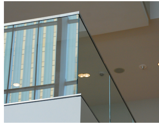
Track Rail™ with stainless steel cap offers sleek styling and support while blending with the museum's minimalist look.