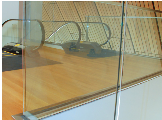
Overlooks are warmed by the hardwood flooring and ceiling installation.