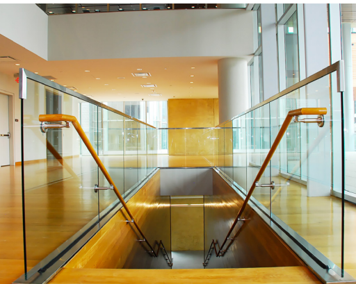
Finished wood handrails provide form and function, complementing the warm architecture of the museum.