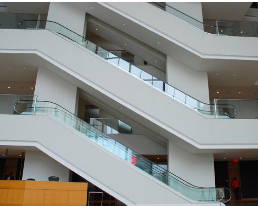
The four-story atrium is clean, yet dramatic.