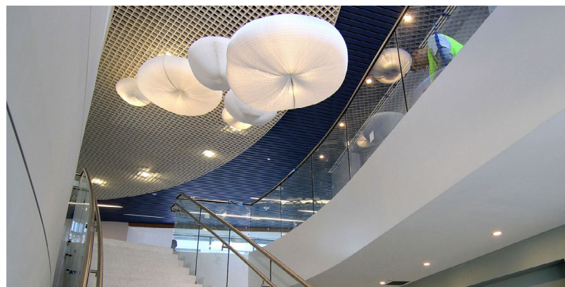
Point series stair railing and Track Rail guardrails create a beautifully cohesive and clean design aesthetic.

We elevate places where experiences happen by providing innovative engineering, fabrication, and installation solutions to the most complex challenges . Discover our unconventional approach.