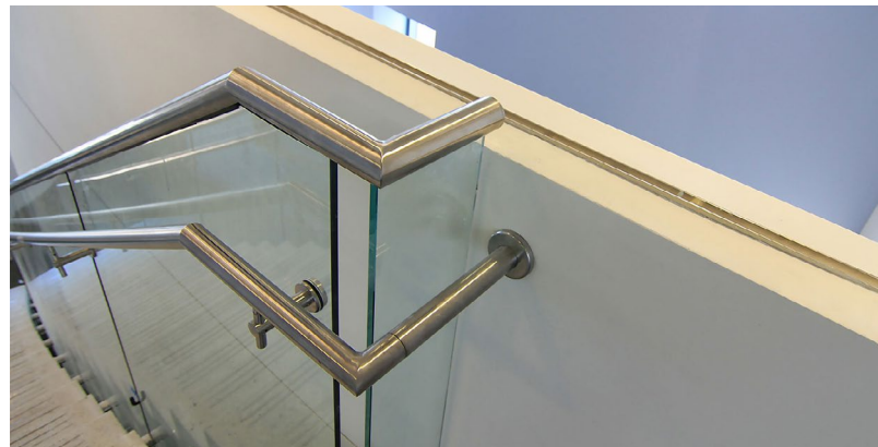
Glass-mounted stainless steel handrails were utilized on staircases.