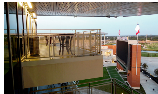
Suite balconies with aluminum perforated railing.