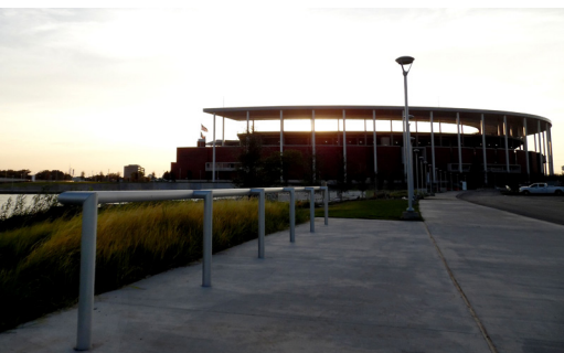
Aluminum tube railing.