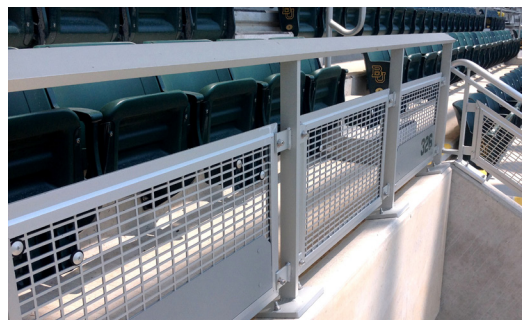
Aluminum guardrail with perforated infill.