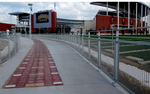
Aluminum guardrail with perforated infill.