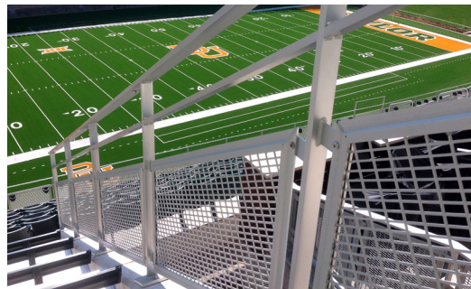
Aluminum guardrail with perforated infill.