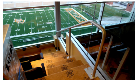
Suite level aluminum handrail.

We elevate places where experiences happen by providing innovative engineering, fabrication, and installation solutions to the most complex challenges. Discover our unconventional approach.