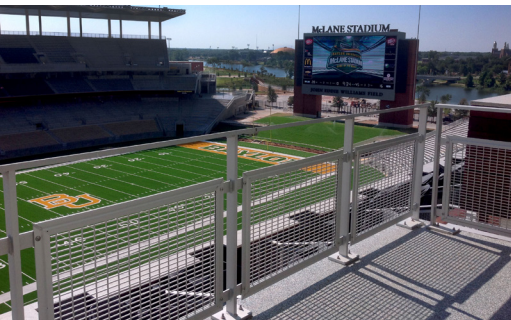
Aluminum guardrail with perforated infill.