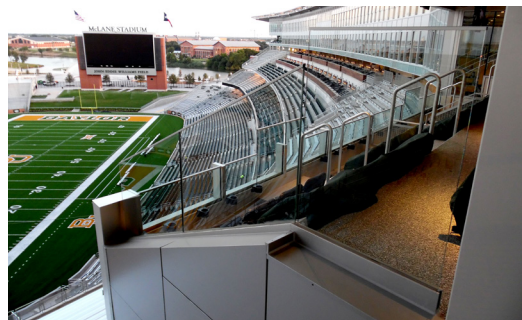
Suite level glass guardrail.