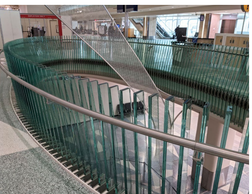
Sightline Commercial Solutions used 90 linear feet of high-end glass fin railing panels.