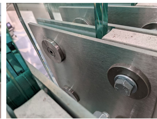
The clear glass fins and knife plates are expertly fit using steel connection pieces that bridge the individual panels to the bottom of the railing system.