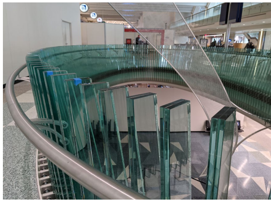
Glass fin railing panels were positioned vertically around the second story overlook.