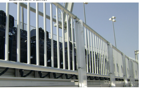
Aluminum side mounted picket railing atfront of bowl and stairs lead to field level.

Gridguard mesh railing with anodized aluminum frame