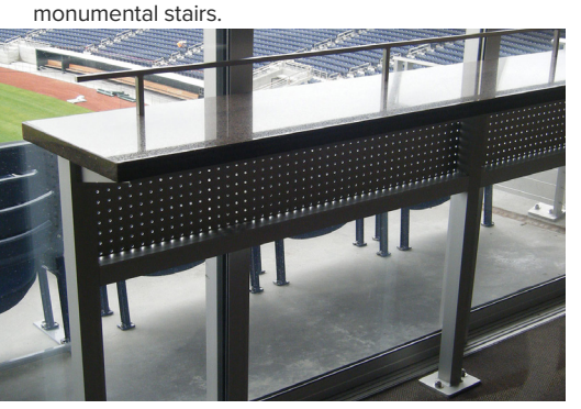
Custom post supported drink rail within suite areas and throughout the ballpark.

Gridguard mesh railing with anodized aluminum frame