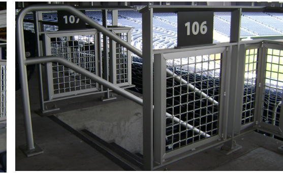
Custom aluminum mesh railing, and aluminum aisle railing