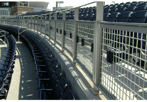
Gridguard intercrimp wire mesh within a U-edge channel border.

Scope: Located in the heart of Omaha, Nebraska, TD Ameritrade Park stands as a beacon of excitement for baseball enthusiasts. The the park has a seating capacity of approximately 24,000 spectators. It features a modern design with spacious concourses, state-of-the-art amenities, and excellent sightlines from every seat, ensuring an immersive experience for fans. Sightline Commercial Solutions provided 15,000 linear feet of ornamental railing to the TD Ameritrade Park which hosts the College World Series, Creighton University Bluejays college baseball among other events. Custom Tensiline™ Cable Railing, Gridguard<sup>™</sup> Mesh Railing, aluminum Griprail<sup>™</sup>, drink rails and Classic Picket Railing are among the railing styles provided.