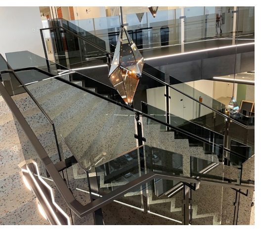
Glass railing provides a mordern and artistic appeal to the stairs.

Handrails assist over 450 employees at the Legacy Building.