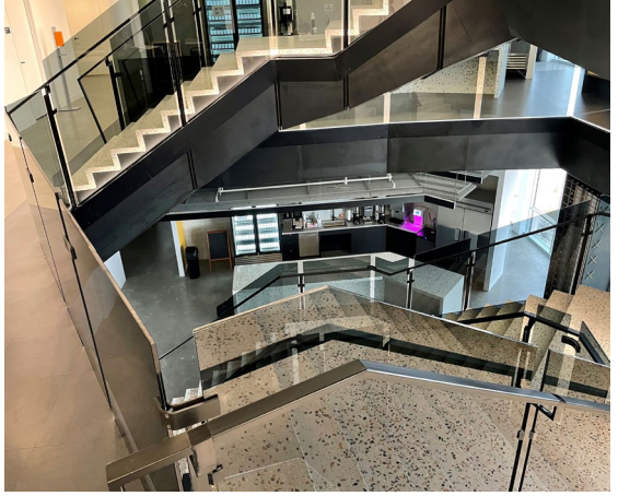
From above, the glass railing is simplistic yet part of the overall design of the space.