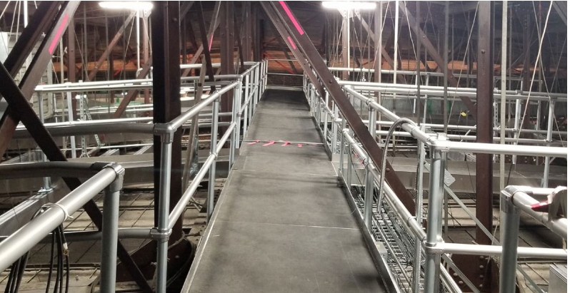
We developed a catwalk-inspired access platform system positioned 80 feet above the main floor of the theater.