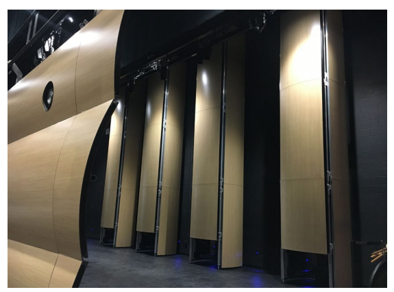
Four shell towers and three rows of acoustical ceiling panels with integrated lighting.