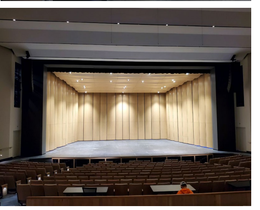
1,000-seat auditorium featuring an expanded stage and state-of-the-art acoustic system.