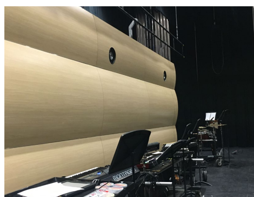
Top-of-the-line Bravado® Acoustical Shell.

We elevate places where experiences happen by providing innovative engineering, fabrication, and <u>installation solutions to</u> the most complex challenges. Discover our unconventional approach.