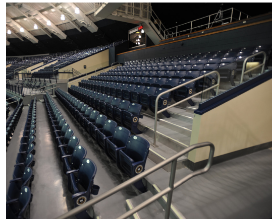
The project encompassed 27,000 square feet of grandstand seating area.