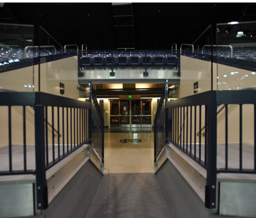
Stair units were included to allow fans to safely travel between floors.