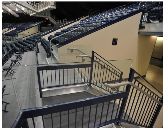
Sightline designed and installed 12 ADA infill seating sections throughout the arena.