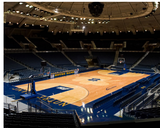
7,500 linear feet of architectural glass and aluminum railings were installed by our team.

We elevate places where experiences happen by providing innovative engineering, fabrication, and installation solutions to the most complex challenges . Discover our unconventional approach.