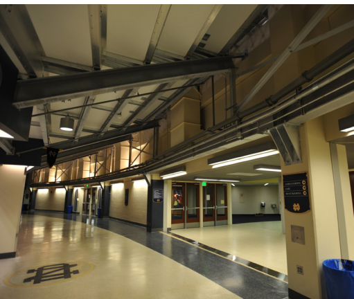
Structural raker beams provide usable walkways below the seating systems.