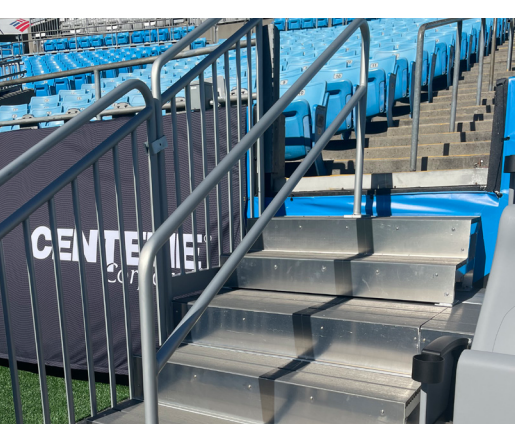
Convenient portable stair units provide quick and safe access

Portable ramps provide ADA compliant access for patrons