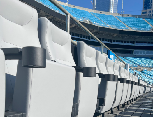
Luxurious comfort provide fans with the best seats in the house

We elevate places where experiences happen by providing innovative engineering, fabrication, and installation solutions to the most complex challenges. Discover our unconventional approach.