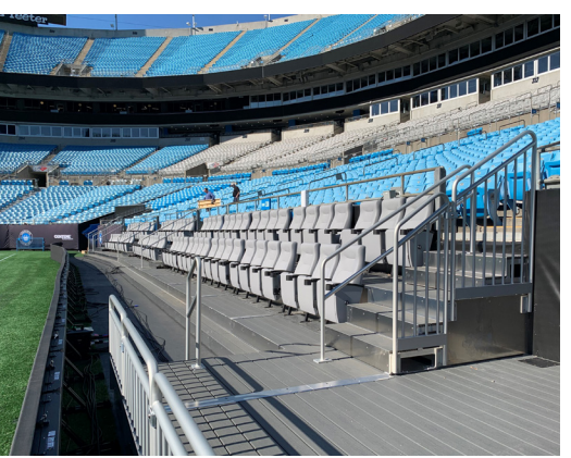
Sightline Commercial Solutions VIP Seating provides an upgraded fan experience

Scope: In 2022, Bank of America Stadium underwent soccer-specific renovations to transform the home of the NFL's Carolina Panthers into an elite venue that now doubles as the home field for the city's Major League Soccer (MLS) team, Charlotte FC. The $50 million project included enhancements to spaces throughout the stadium, including the main concourse, supporters' bar, locker rooms, players tunnel, premium club and new field-level VIP seating. Sightline Commercial Solutions enhanced the VIP seating area to allow for easy conversion between the MLS and NFL seasons. Seating risers were paired with Griprail and high-performance, low-maintenance composite decking to create the exclusive and versatile viewing section. The Surround Foam System adds comfort and maintains a cool temperature for long-lasting use, and the patented drop-in assembly simplifies installation and servicing. The section also can be configured with Sightline Commercial Solutions' camera platforms to provide unobstructed sightlines for media and camera operators.