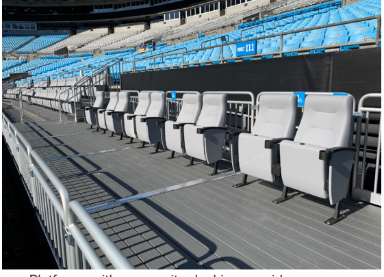
Platforms with composite decking provides longevity with aesthetic