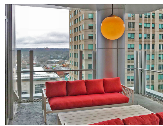
On the northwest side of the building, the windscreen system creates an "al fresco" experience for residents