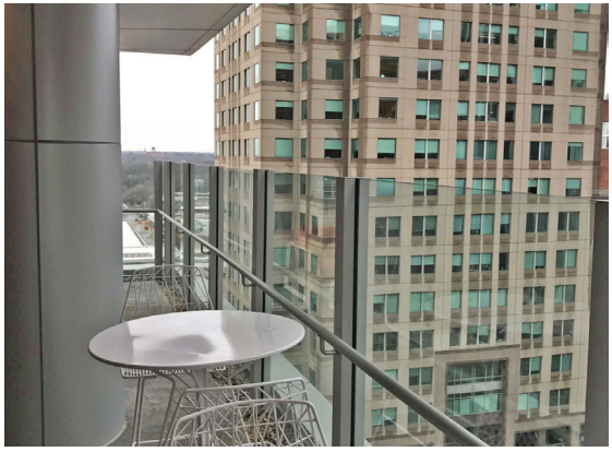
Ascent features 9/16" clear, tempered, laminated glass with SGP interlayer, providing a protective barrier against wind.