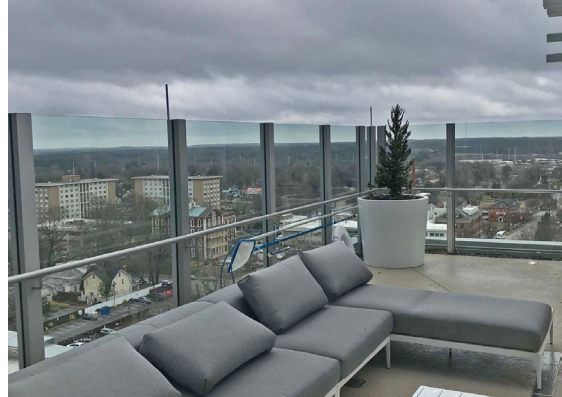
At a standard height of 6 ft., the Ascent Windscreen System provides ample coverage for furniture and patrons.