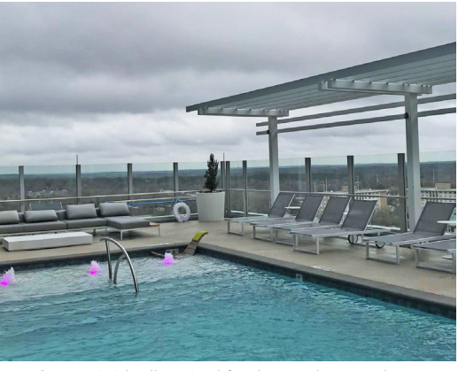
Ascent is ideally suited for the outdoor pool area creating a protected and comfortable environment.