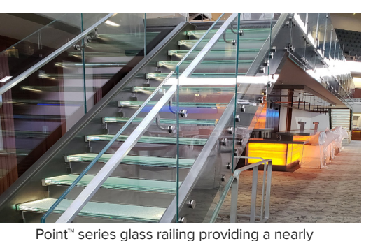
invisible look at the North Club stair.