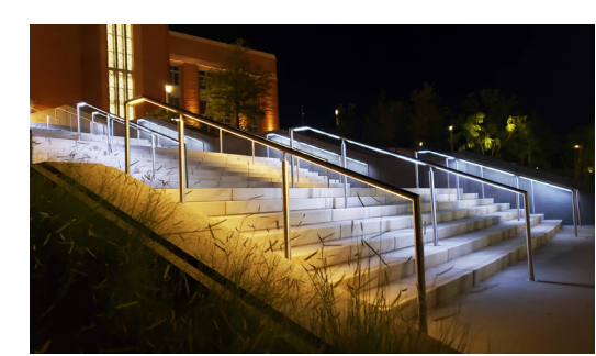
Modern LED handrails on the exterior provide an important safety function.

We elevate places where experiences happen by providing innovative engineering, fabrication, and installation solutions to the most complex challenges. Discover our unconventional approach.