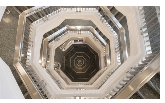
Custom guardrails were engineered using 3D scanning technology.