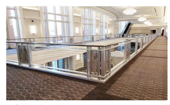
Cable rail provides a decorative appearance and accompanies the arena's concourse.