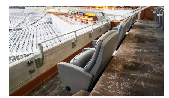
Minimal sightline obstruction with Tensiline™ railing in front of fan seating.