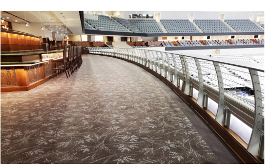
Curved posts guardrail at the North Club offers unobstructed views.

Scope: Dickies Arena is Fort Worth's new crown jewel and go-to destination for sports, concerts and major events, such as the annual Stock & Rodeo Show. The design of Dickies Arena draws inspiration from the classic architecture of Texas and combines it with modern amenities. At 750,000 square feet, the multipurpose venue features 14,000 linear feet of custom architectural railing from Sightline Commercial Solutions. Railing types include picket, cable, guardrail, LED handrail and glass railing, designed to enhance the accessibility, safety and overall fan experience inside and outside the arena. The railings complement the building's stunning art deco architecture, most prominent on the stairs, balconies and pedestrian bridge. Iconic prairie motifs are incorporated in the metalwork and railings, as well.