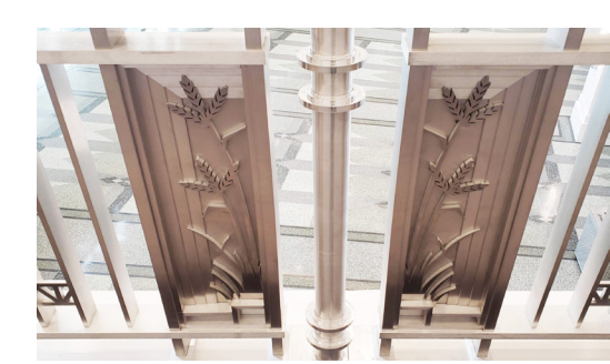
The Lone Star State's native prarie grass is incorporated into the custom balcony rail.