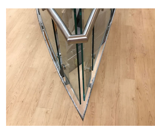
Distinctive details punctuate a unique railing application.

We elevate places where experiences happen by providing innovative engineering, fabrication, and installation solutions to the most complex challenges. Discover our unconventional approach.