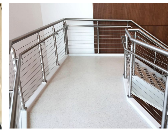
The stainless handrails on stairs feature inlaid LED lighting.