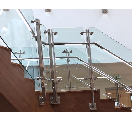
Posts were welded to mounting plates, which were attached to the fascia by drill and tap method.