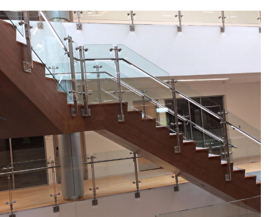
Railing posts were fascia-mounted, directly to the stair stringer.

Sacred Heart University is the second largest Catholic university in New England. With over 8,000 students, safety is among the top most important factors for the university. This project called for nearly 1,500 linear feet of various stainless railing styles. Our team designed, engineered, and installed rail for interior stairs, walkways, and overlooks featuring Luxor, our double-bar post, and glass railing design. The goal was to provide a clean aesthetic. We achieved this in the interior space by using a robust, yet low-profile post railing design. LED lighting accentuates much of the interior stainless handrail application. Distinctive details were used to accommodate the unique railing applications.