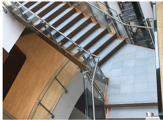
The omission of a top cap creates a sleek railing profile.